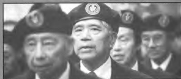
Unwanted Soldiers dir. Jari Osborne

To order The Documentary Channel contact your satellite or cable provider.