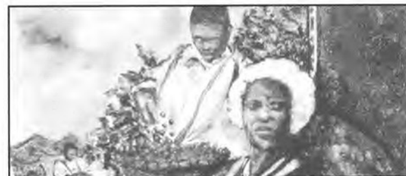
Black Soul/Âme Noire dir. Martine Chartrand Golden Bear Award, Best Short Film Berlin International Film Festival