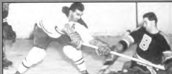
The Rocket dir. Jacques Payette

Documentary classics from the National Film Board