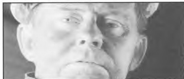
Westray dir. Paul Cowan Premiering: Montreal World Film Festival, Toronto International Film Festival Atlantic Film Festival, Cinefest Sudbury International Film Festival.