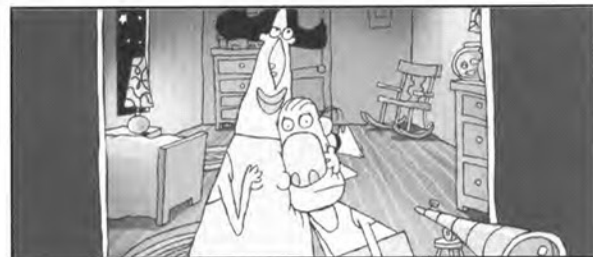
Strange Invaders dir. Cordell Barker Special Distinction, International Animated Film Festival, Annecy