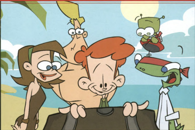
OLLIE'S UNDER-THE-BED ADVENTURE Produced by Collideascope Digital Productions