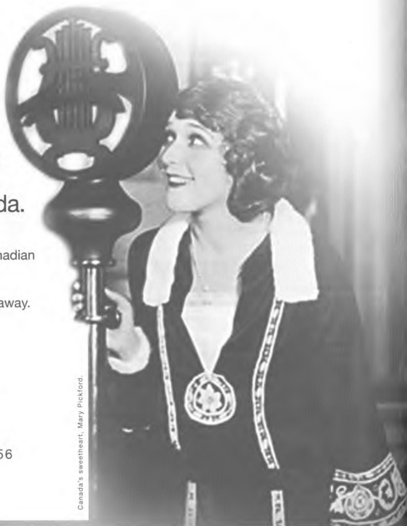
Canada's sweetheart, Mary Pickford.