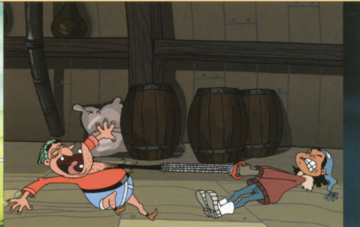
YVON OF THE YUKON Produced by Studio B Productions Co-produced by Hong Ying Animation (China)