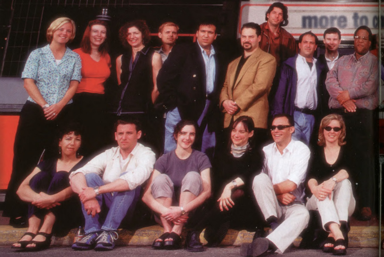
Location: Eglinton Theatre