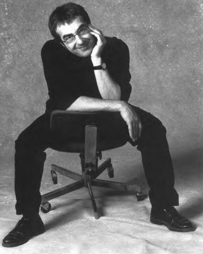
Atom Egoyan: Director/producer/writer