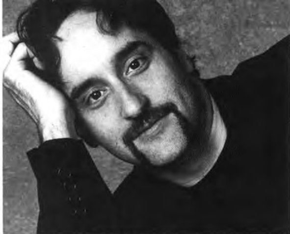
Don McKellar: Writer/actor/director

the understanding to bring these films to market.