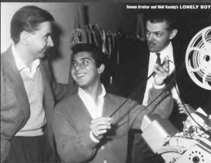
Roman Kroitor and Wolf Koenig's LONELY BOY

With Michel Brault and Pierre Perrault's ACADIA, ACADIA?!?