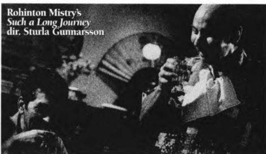
Rohinton Mistry's Such a Long Journey dir. Sturla Gunnarsson