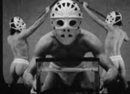
THE MAKING OF MONSTERS (Golden Teddy Bear Award, Berlin International Film Festival)