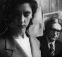
BLUE (Gold Plaque, Chicago International Film Festival)