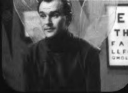
THE FAIRY WHO DIDN'T WANT TO BE A FAIRY ANYMORE (Genie Award, Best Live Action Short Dramatic Film)