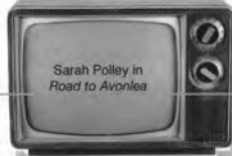
Sarah Polley in Road to Avonlea