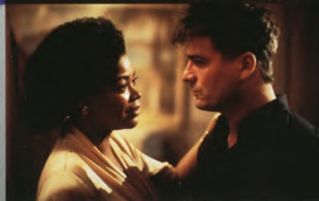
April One Murray Battle

Head Office 600 de la Gauchetière Street West 14th Floor Montréal, Quebec H3B 4L8 Telephone: (514) 283-6363 Fax: (514) 283-8212