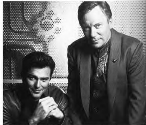
William (Captain Kirk) Shatner, right, was the force behind TekWar.

Shatner's TekWar in association with USA Network; four MOWs and 18 episodes of TekWar were shot before wrapping in 1995. Kurt Vonnegut's Harrison Bergeron with Sean Astin and Christopher Plummer is being produced with Showtime. The Man in the Attic with Anne Archer ( Patriot Games ) is another Atlantis/Showtime/CBS co-production; Night of the Twisters with Devon Sawa and John Schneider is a co-production with the (U.S.) Family Channel; and The Possession of Michael D. with Sheila McCarthy and Stephen Lang was produced in association with the Fox Broadcasting Network.