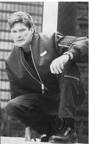
Hasselhoff dodges bullets from the bad guys.

North America (after Los Angeles). Out of the 62 MOWs, mini-series, specials, pilots and docudramas produced in Toronto in 1995, 66 per cent were Canadian-produced in association with American cable outlets. Little-known companies such as Dufferin Gate Productions and Power Pictures accounted for 22 MOWs in 1995. This is in addition to the established players like Alliance Entertainment and Atlantis Films, which have come to dominate Canadian-U.S.