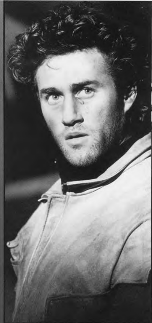
Roy Dupuis in SCREAMERS

On a distant mining planet, war continues between the Alliance, a federation of mine workers, and its massive former multinational/multi-planetary boss, The New Economic Block (NEB). The Alliance looks to be winning the war after its scientists create a perfect weapon—a self-replicating killing machine programmed to kill all enemy life forms. The year is 2078—about 50 years after the information in Johnny's brain cures NAS—and the machines, left to replicate in the harsh planet scrub, have evolved into several