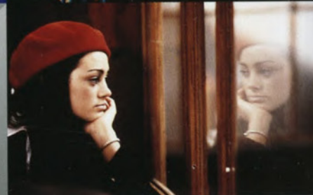
C'était le 12 du 12 et Chili avait les blues Charles Binamé

Head Office Tour de la Banque Nationale 600 de la Gauchetière Street West 14th Floor Montréal, Quebec H3B 4L8 Telephone: (514) 283-6363 Fax: (514) 283-8212