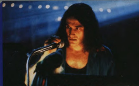
Exotica Atom Egoyan

Telefilm Canada, a major partner in the Canadian film and television industry