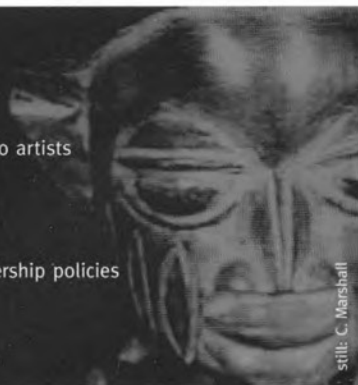
still: C. Marshall

Affordable technology access for film, video & audio artists Betacam production & post-production AVID non-linear digital editing system Digital audio suite Phone or write to inquire about workshops, membership policies and our National Access program. tel: 416-365-0564 fax: 416-365-3332 65 Bellwoods Avenue, Toronto, Canada M6J 3N4