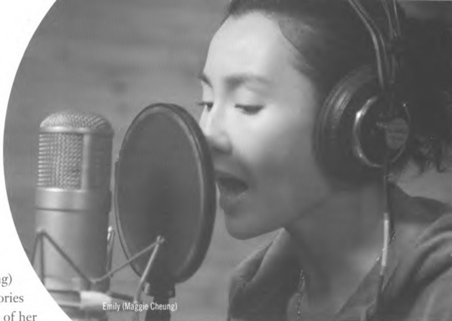
Emily (Maggie Cheung)

The only completely likable and fleshed-out character is Albrecht. Nolte delivers a subdued performance as the kindly grandfather who believes in Emily even though she's given him no reason to in the past. His charm lies in the calm patience he has with his unpredictable daughter-in-law. Not always one for playing the most likable of