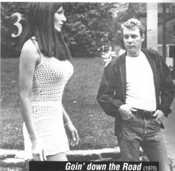
Goin' down the Road (1970)