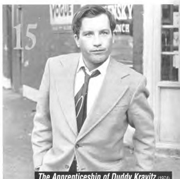
The Apprenticeship of Duddy Kravitz (1974)