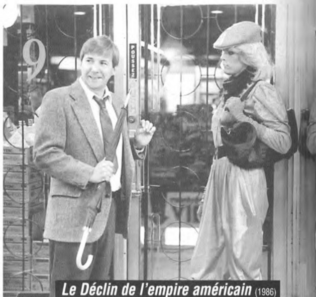
Le Déclin de l'empire américain (1986)