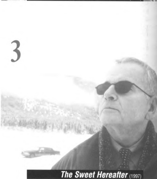
The Sweet Hereafter (1997)