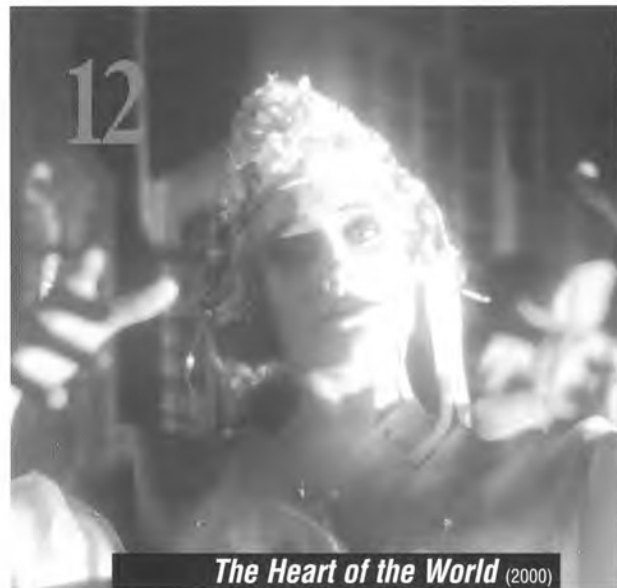
The Heart of the World (2000)