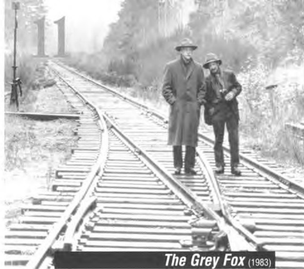
The Grey Fox (1983)

RON FOLEY MACDONALD Writer Mon oncle Antoine Goin' down the Road Jésus de Montréal Life Classes The Hanging Garden My American Cousin Bye Bye Blues Manufacturing Consent Picture of Light Lilies