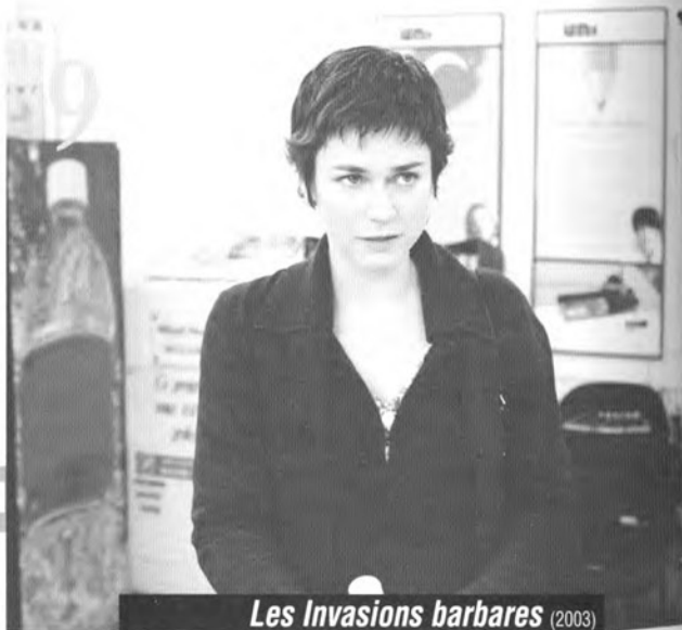
Les Invasions barbares (2003)