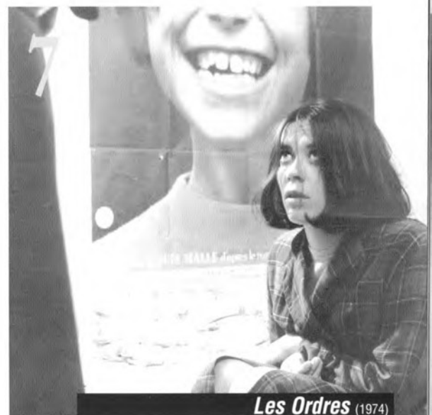
Les Ordres (1974)