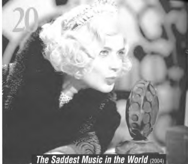
The Saddest Music in the World (2004)

The lists were compiled by Josey Matos of the Toronto International Film Festival Group and were based on the following parameters: (1) The films must have been a certified Canadian production or co-production and/or directed by a Canadian citizen or a Canadian resident; and (2) Any film of whatever genre, format or length was eligible, including animated, short, documentary and experimental works. *Indicates foreign films shot in Canada. The Toronto International Film Festival Group is a charitable, cultural and educational organization devoted to celebrating excellence in film and moving image.