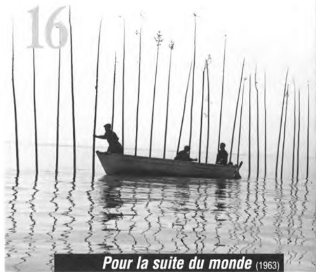
Pour la suite du monde (1963)