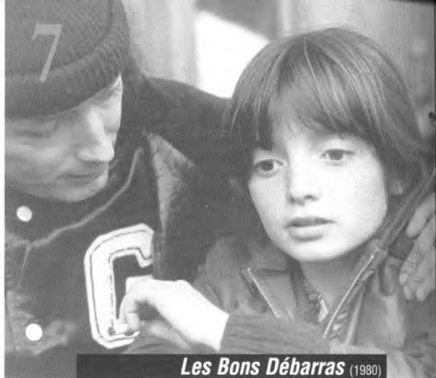
Les Bons Débarras (1980)

Director and CEO, TIFFG (in chronological order) Pour la suite du monde Le Chat dans le sac Wavelength La Vraie Nature de Bernadette Réjeanne Padovani Between Friends Le Vieux Pays où Rimbaud est mort Life Classes Calendar Crash