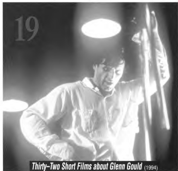
Thirty-Two Short Films about Glenn Gould (1994)