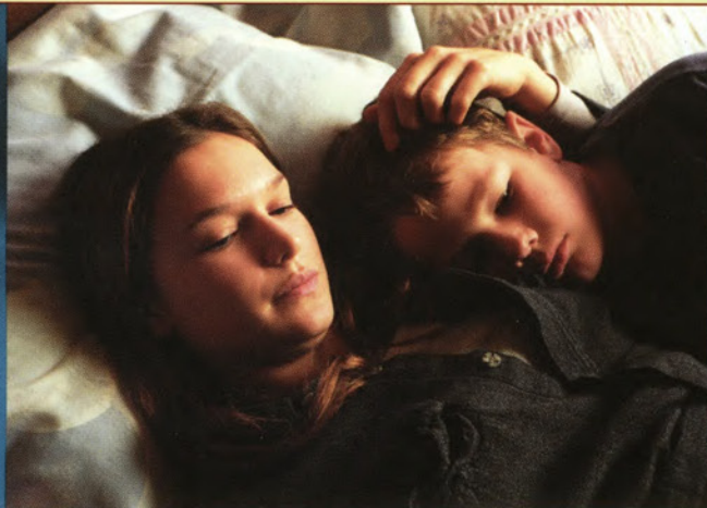
FLOWER & GARNET Réalisé par Keith Behrman Produit par Ministry of Extreme Circumstances Film Inc.