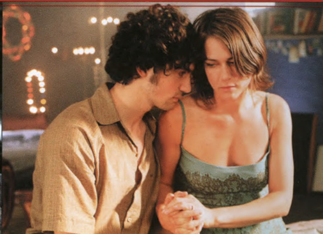
ARARAT Directed by Atom Egoyan Produced by Serendipity Point Films