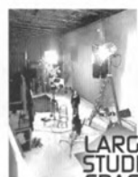
LARGE STUDIO SPACE

Check out our other properties and services: