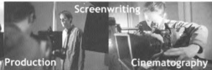
Film & Video Production