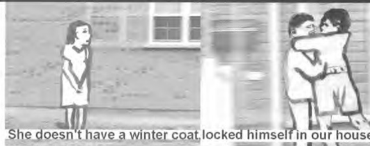
Libby Hague's Our Town .

Morose existential cowboys, ruminations on fleeting love, fast chopsticks that kill, kill, kill, and a giant slug named Laura hitchhiking to Winnipeg - it looks like Canadian filmmakers have more up their creative sleeves than pallid adventures of an all-male curling team. Now in its 15th year, the Images