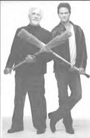
Leslie Nielsen and Paul Gross.

The screening that night was packed and the audience buzzed. If Winnipeg is, indeed, the curling capital of the universe, then the film could not have found a better, more forgiving audience. From the opening strains of "The Land of the Silverbirch," a campfire song everyone seemed to know, to the closing beavers and a