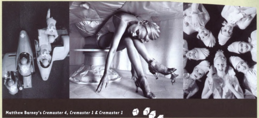
Matthew Barney's Cremaster 4 , Cremaster 1 & Cremaster 1