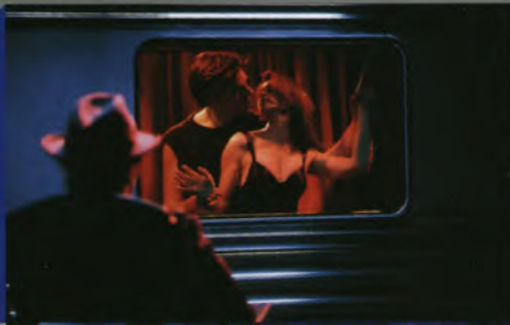
Mouvements du désir Léa Pool

Telefilm Canada, a major partner in the Canadian film and television industry